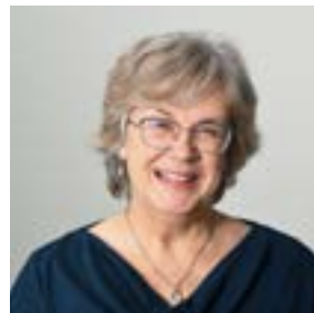
Ruth Beeston Chair